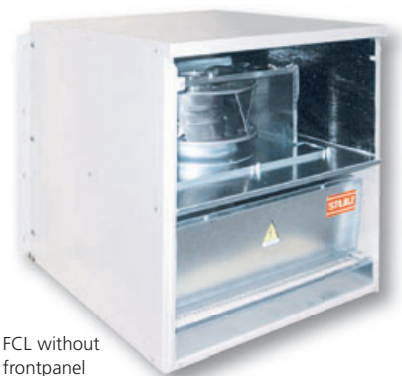
FCL without frontpanel

During normal operation, Free-Air provides energy-saving cooling with a reduced airflow. If a comfort unit shuts down because of a fault, Free-Air takes over and continues to provide cooling in backup mode with the maximum airflow.